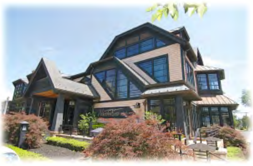
The English Manor Ocean Township, New Jersey