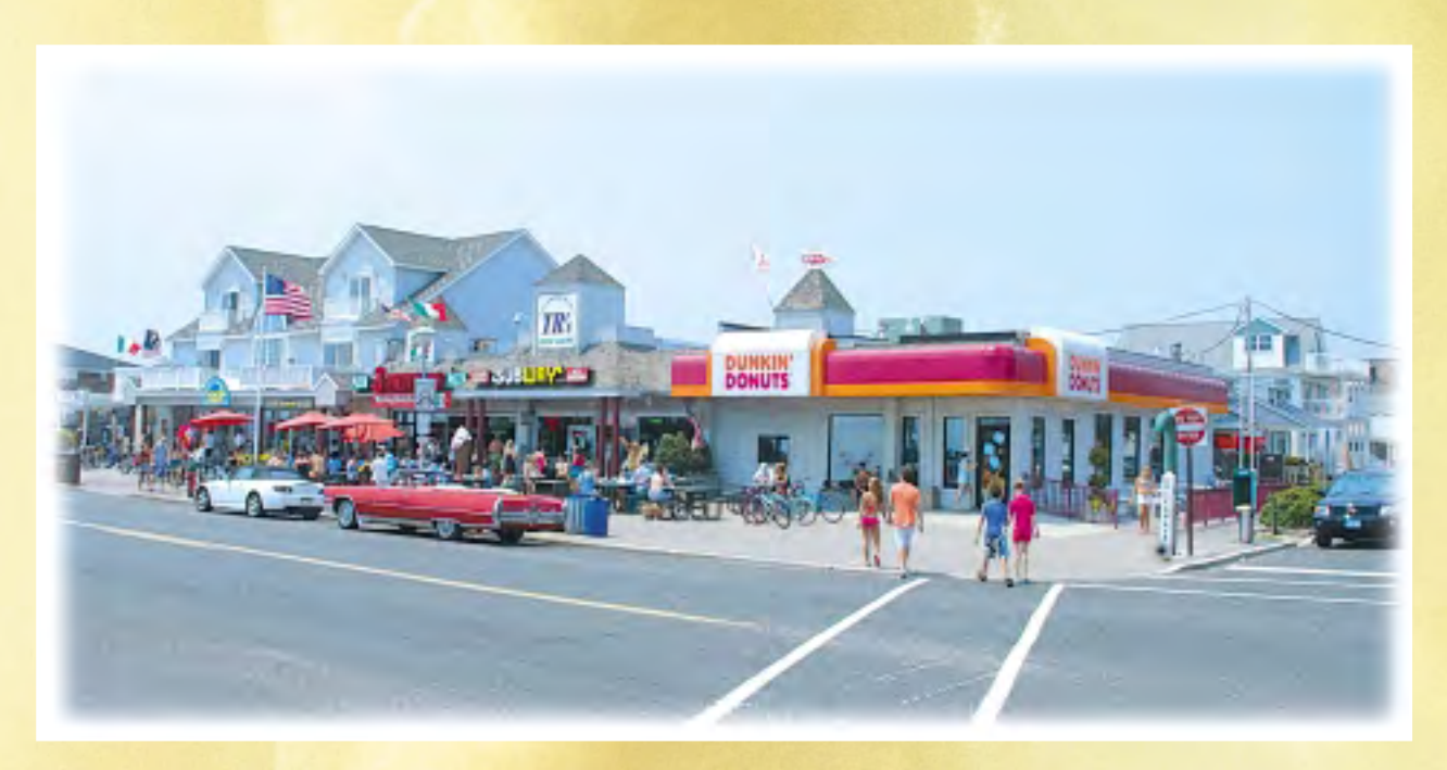
Ocean Front Retail/Residential Development Belmar, New Jersey